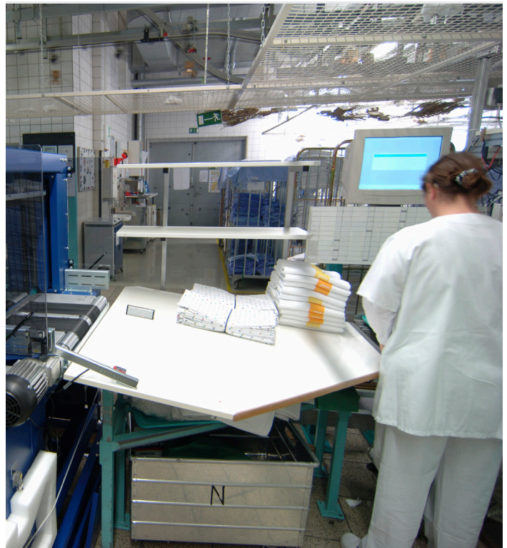
Combined Services Customer since 2005

Combined Services is a commercial laundry and linen service in Miami, FL. It's important to keep their natural gas expenditures within a certain annual expense amount. The budget stability of fixed pricing provides just what they need.