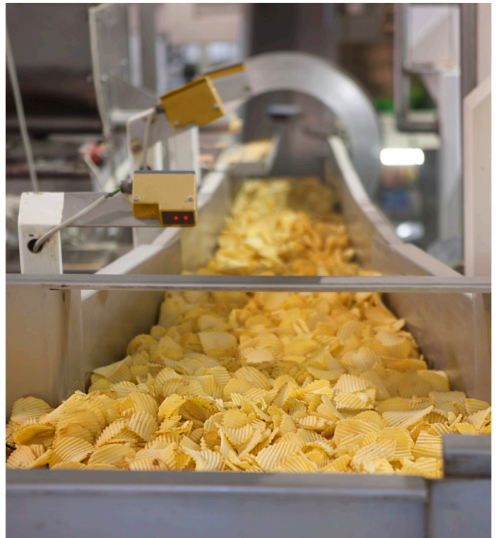
ARA Food Corporation Customer Since 2004

ARA Food Corporation a snack food manufacturer has been operating in South Florida since 1975. Our fixed price plan allows them to hedge their natural gas expenses and takes market fluctuations out of the equation.