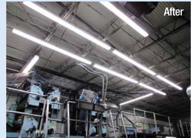
Brighter lighting in the Charlotte Print Center increases employee safety and improves the work environment.